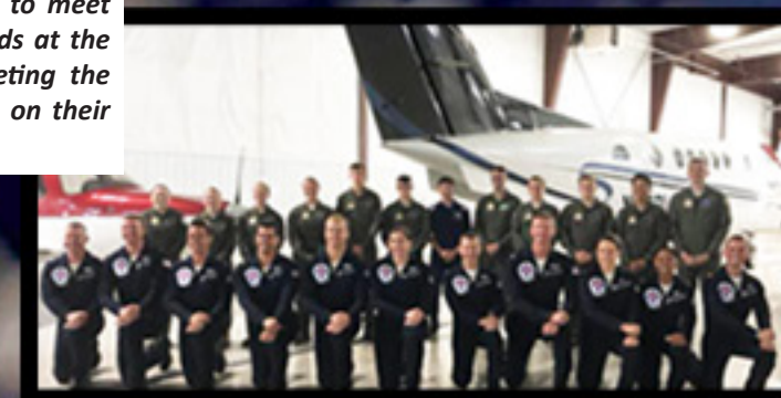
Flight Academy Cadets attending the University of North Dakota got the opportunity to meet the members of the USAF Thunderbirds at the Fargo Air Show. In addition to meeting the Thunderbirds, the cadets got to sit in on their pre-show brief.

already, find an opportunity to lead. It doesn't have to be in Air Force Junior ROTC and in fact helps to have additional leadership outside of your unit. Participate in your unit's aviation related LDRs, multi-copter, rockets, etc.... Participate in the CAP orientation flight program. All of the scholarship recipients were well-rounded individuals who have a desire to explore aviation. This year's selectees will be the same. We're calling on all cadets who have at least a 3.0 GPA, are current enrolled in Air Force Junior ROTC as a sophomore, junior, or senior year for 2019-2020 school year, and have an interest in aviation to apply to this year's Chief of Staff of the Air Force Private Pilot Scholarship. See your instructors for additional information.