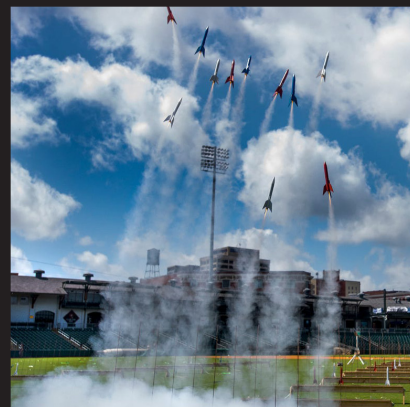
Red, white and blue rockets are launched, at Riverwalk Stadium in Montgomery, Ala., as JROTC students commemorate the 50th anniversary of the Apollo 11 moon landing on Tuesday July 16, 2019.