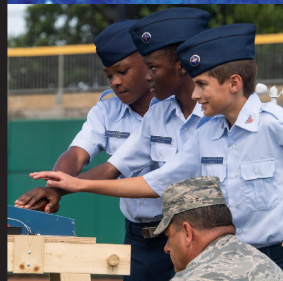
Rockets are launched.