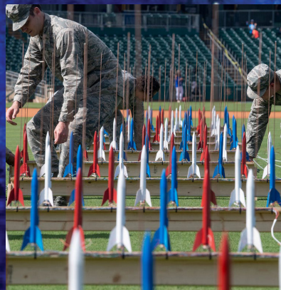
Rockets are prepared for launch.